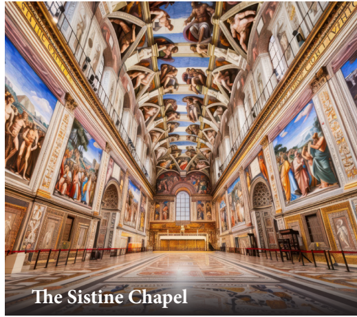
The Sistine Chapel