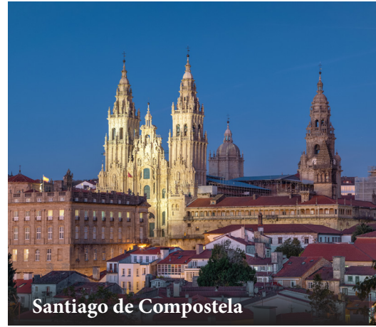
Santiago de Compostela

spring, and the Shrine of Bernadette. You'll also experience the Stations of the Cross. The rest of the day is free for personal reflection or ceremonies. Dinner and overnight at the hotel will follow.